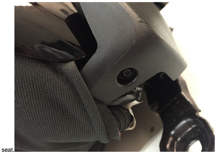
Next lift the rear of the cover up and away from the base of the seat. You a clearing it off the metal clip shown