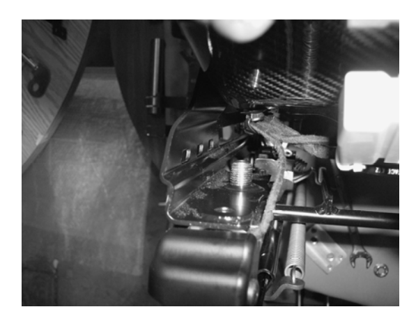
Step 4: Remove the three nuts that secure the black box to the under side of the seat. To do so, pull up the seat cushion to gain access to the Allen key bolt heads.