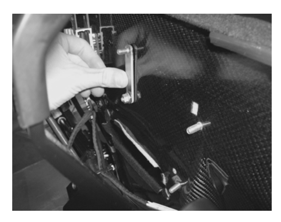
Step 6: Position the black box on the tab's stud and upper right most stud so that the box's orientation is like that shown below. Cutting of the one or more zip ties may be necessary. Tighten all three bolts, and tighten the supplied flange nut for the tab stud.